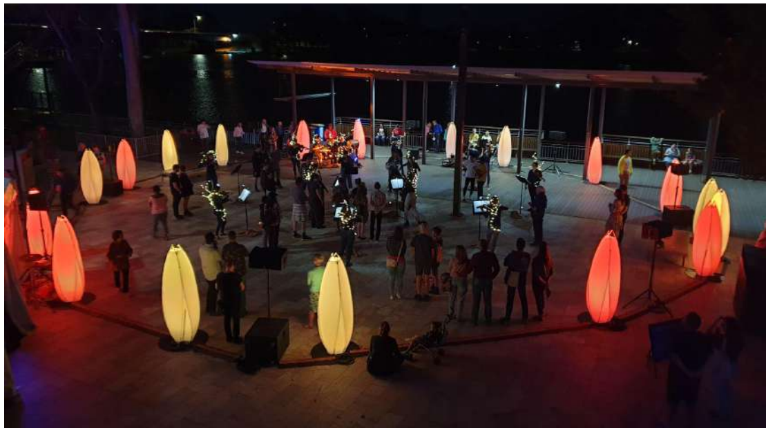
Sister project, 'Song to the Earth' Tech Run at the Rockhampton River Festival 2022